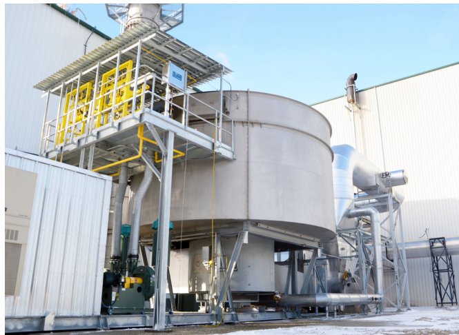
Oxi.X RL with single rotary diverter valve